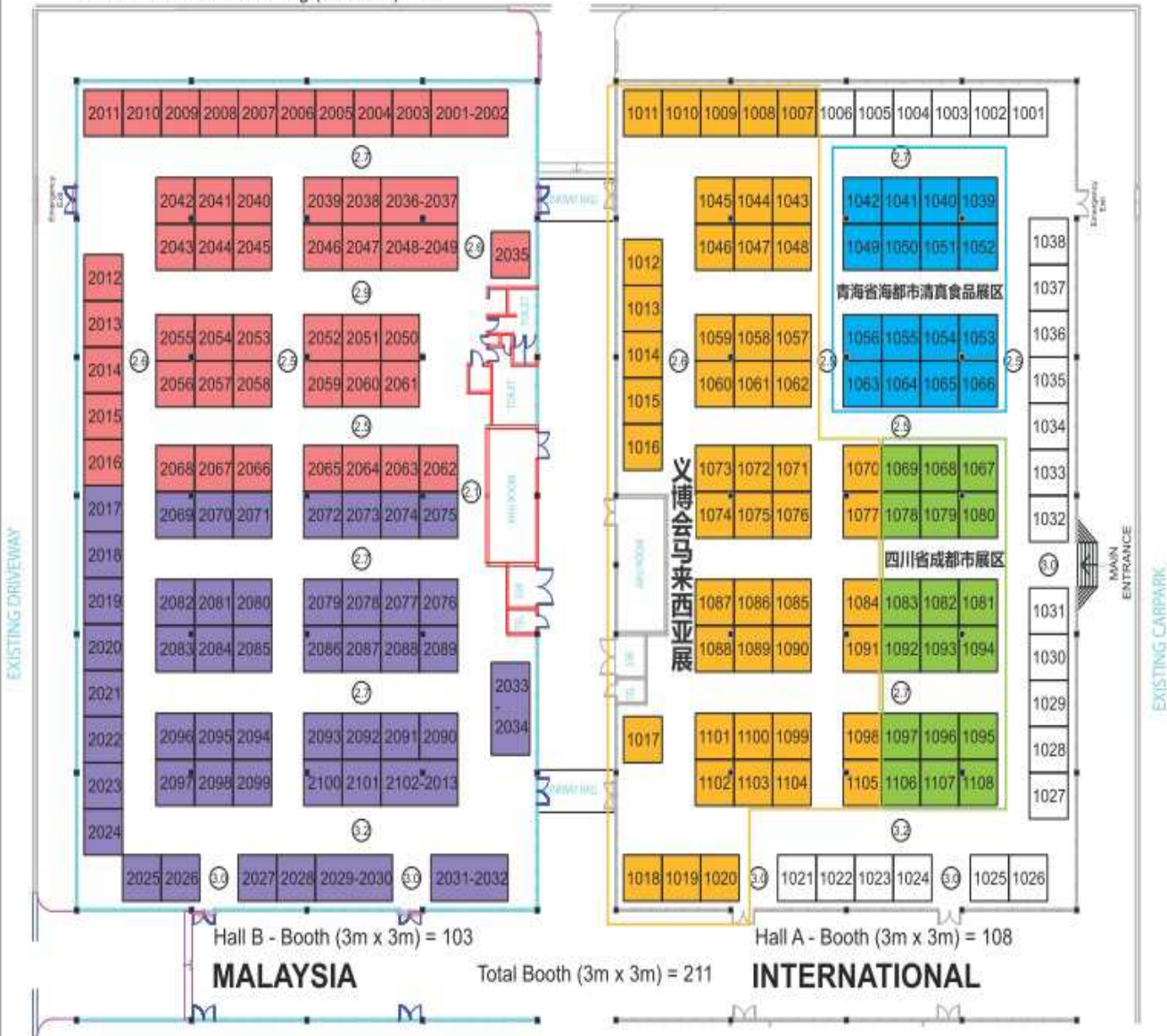
Hall B - Booth (3m x 3m) = 103